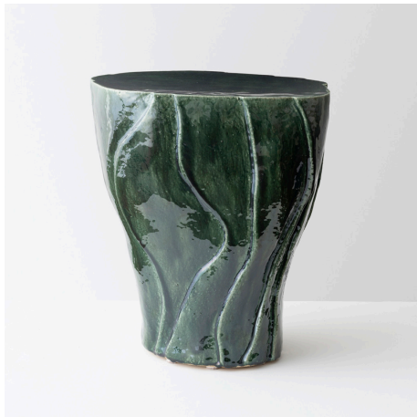
Ripple Side Table Hand-built stoneware L 16 1/2" x W 16" x H 18"