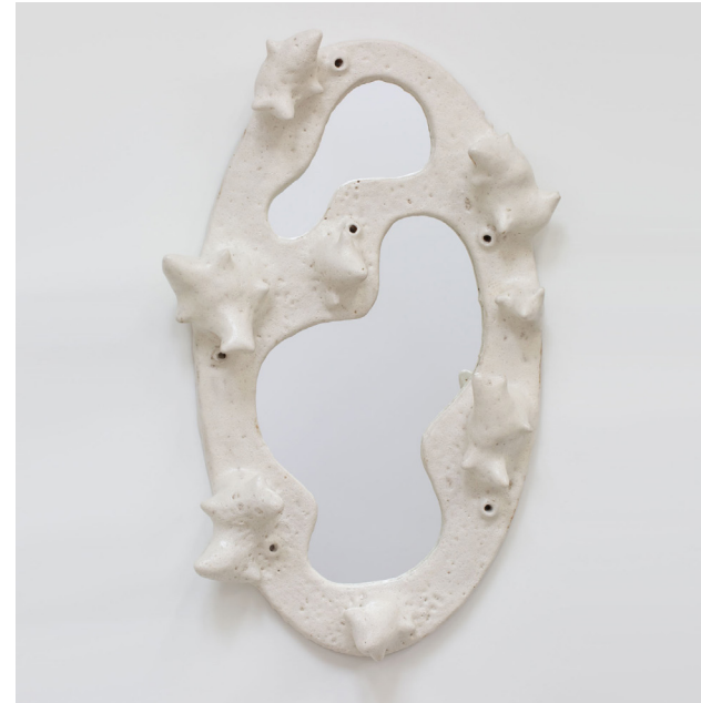
Pseudopodia Mirror Hand-built stoneware L 33" x W 21" x D 5"