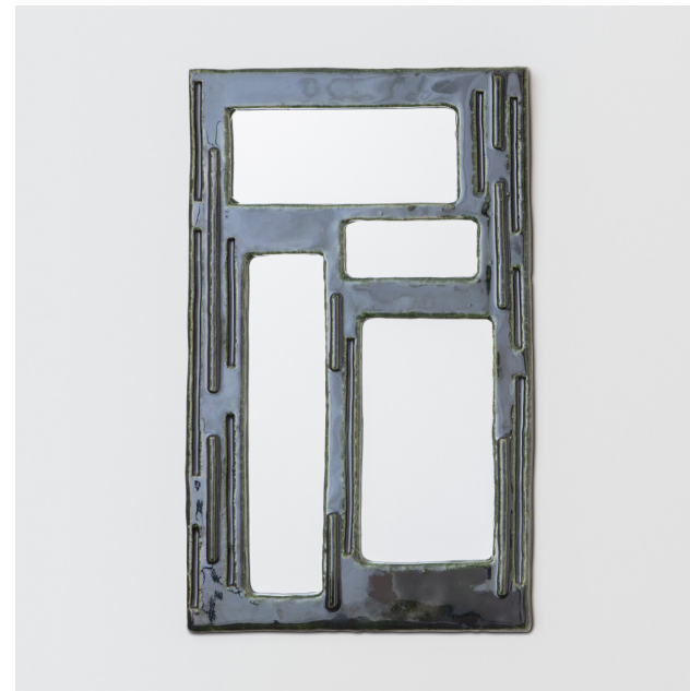
Channel Mirror Hand-built stoneware H 27" x W 16" x D 1"