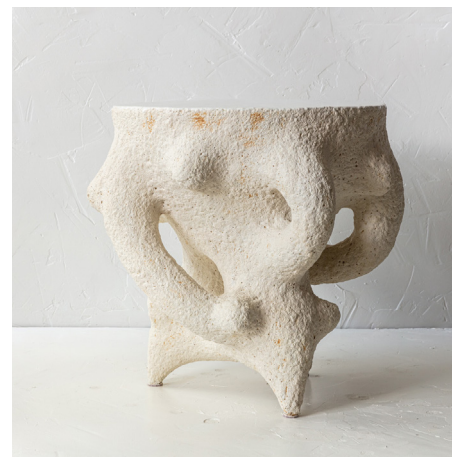
Pseudopodia Side Table Hand-built stoneware 19" Dia x 26" W (overall) x 20" H