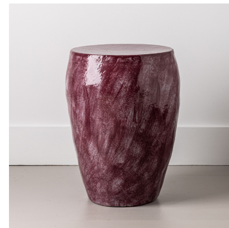
Ceramic Drum Side Table Hand-built stoneware Dia 13" x H 18"