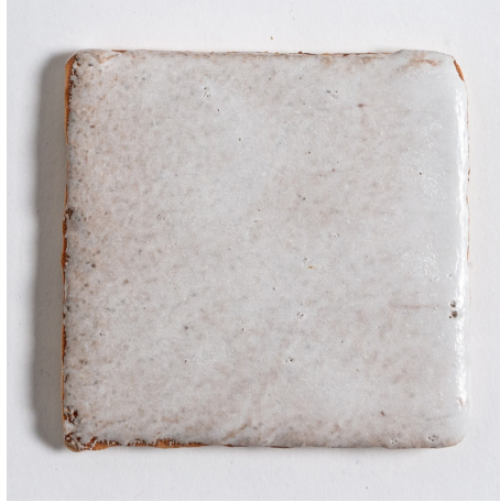
White Cloud 9