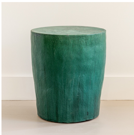
Ceramic Side Table Hand-built stoneware Dia 14 1/2" x H 18"