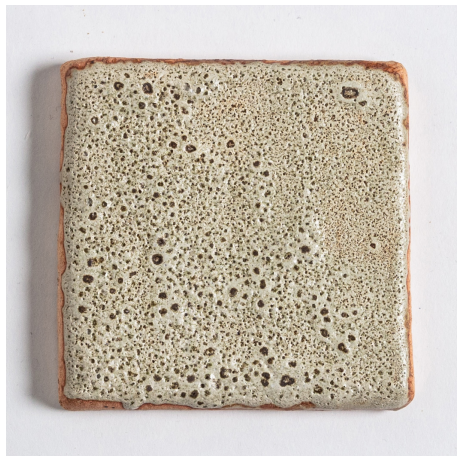
Light Speckled Green