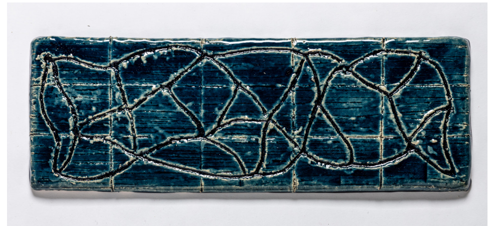
Glaze: Deb's Blue Design: Tangled WCS 035