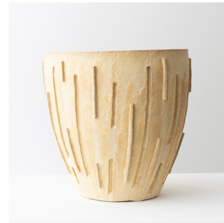
Channel Side Table Hand-built stoneware Dia 13" x H 17"