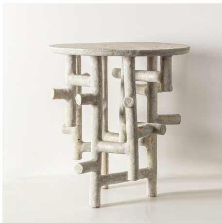
Extrude Side Table Hand-built stoneware Dia 16" x H 18"