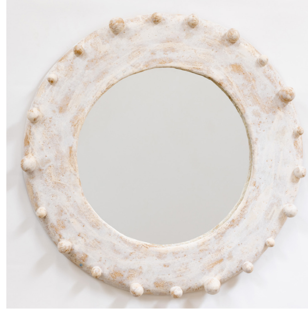
Bubble Mirror Hand-built stoneware Dia 21"