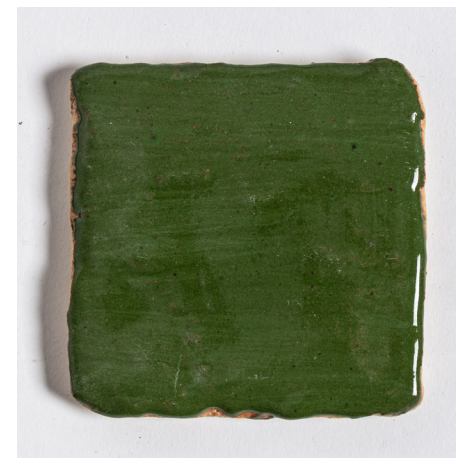
Odyssey Green with Tin