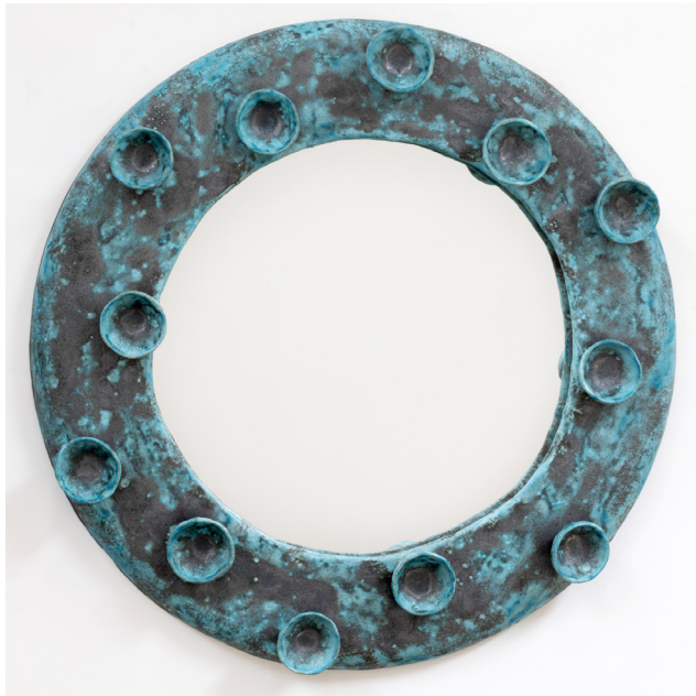
Disk Bubble Mirror Hand-built stoneware Dia 24"