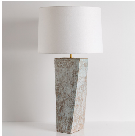
Tall Slab Lamp Hand-built stoneware Base: L 8" x W 8" x H 20 1/2"