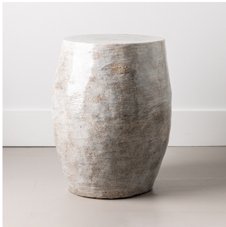
Ceramic Drum Side Table Hand-built stoneware Dia 13" x H 18"