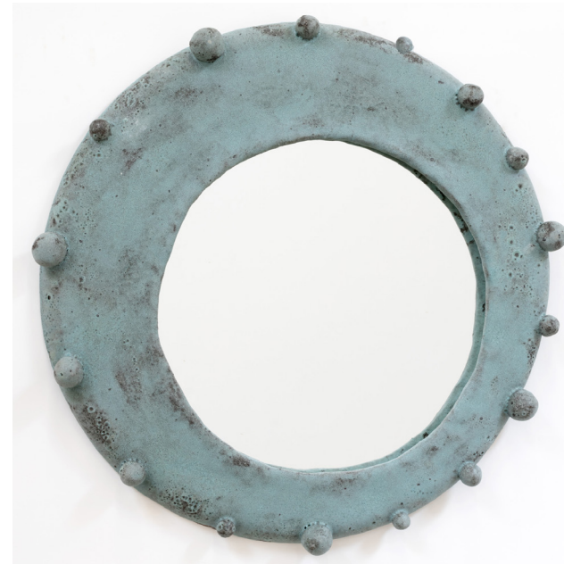
Askew Bubble Mirror Hand-built stoneware Dia 24"