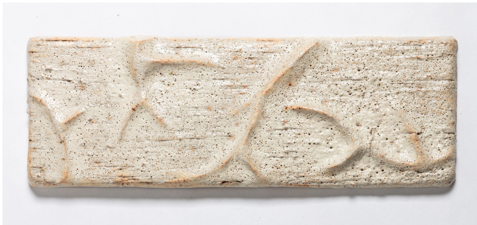
Glaze: Off-White Lava Design: Vine WCS 051