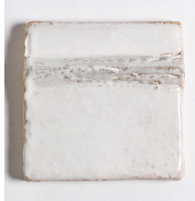
Glaze: Batz White Design: Ridge