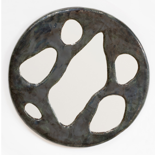
Freeform Circle Mirror Hand-built stoneware Dia 32"