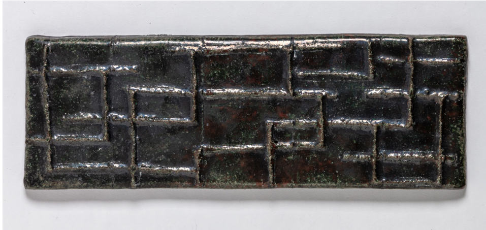
Glaze: Metallic Oribe Design: Grid WCS 050