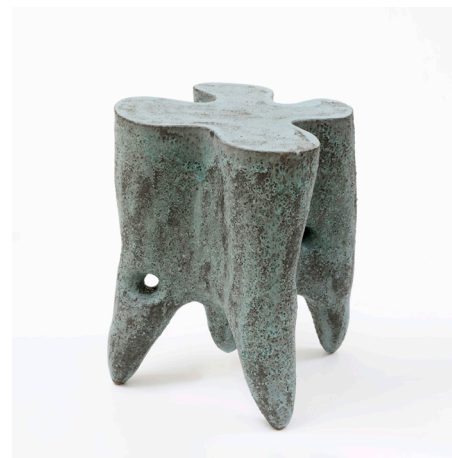
Stalagmite Side Table Hand-built stoneware Dia 15" x H 17"