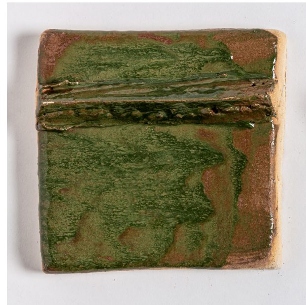
Glaze: Odyssey Green Design: Ridge