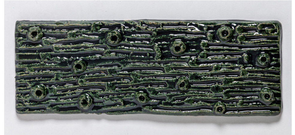
Glaze: Green Oribe Design: Bark WCS 052