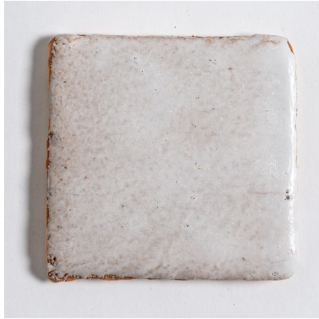
White Cloud 9