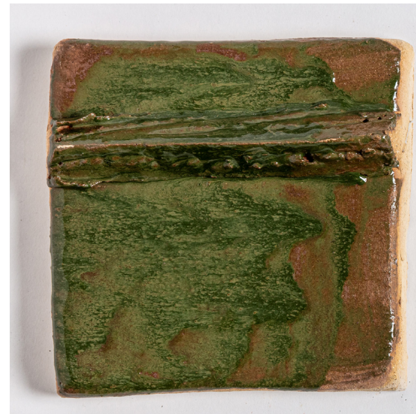
Glaze: Odyssey Green Design: Ridge