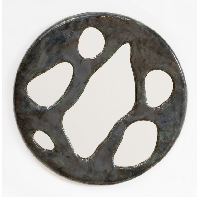
Freeform Circle Mirror Hand-built stoneware Dia 32"