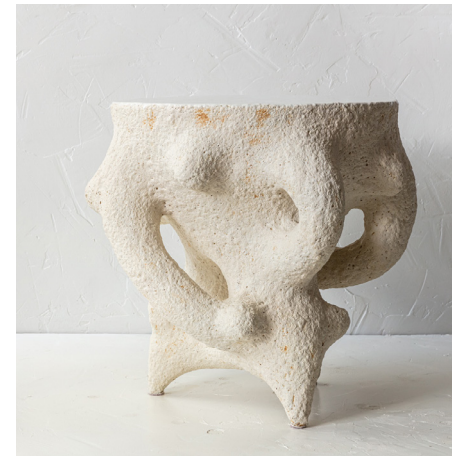
Pseudopodia Side Table Hand-built stoneware Dia 26" x H 20"