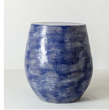
Ceramic Drum Side Table Hand-built stoneware Dia 15" x H 18"