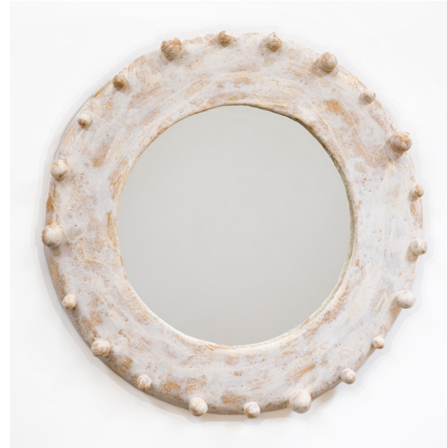
Bubble Mirror Hand-built stoneware Dia 21"