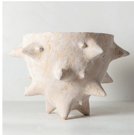
Pseudopodia Spike Side Table Hand-built stoneware Dia 24" x H 16"