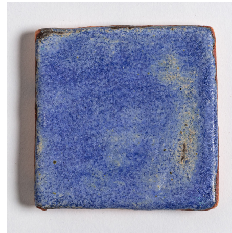
Blue Cloud 9