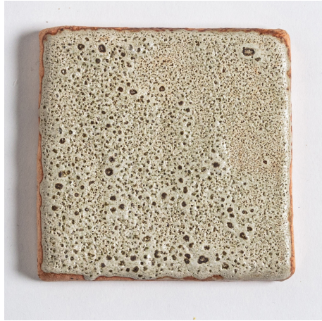
Light Speckled Green