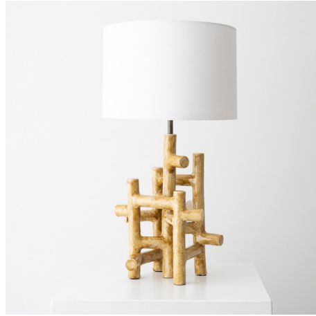
Extrude Table Lamp Hand-built stoneware L 11" x W 10" x H 15"