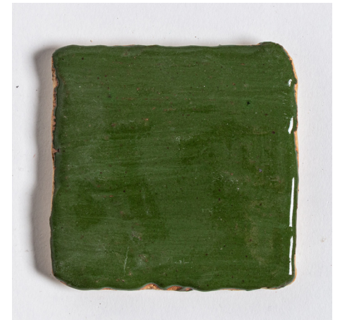
Odyssey Green with Tin