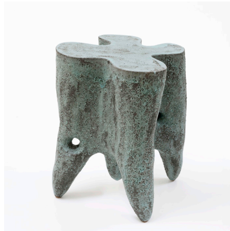
Stalagmite Side Table Hand-built stoneware Dia 15" x H 17"