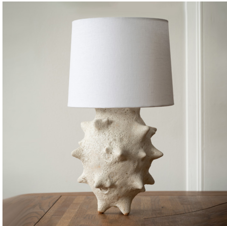
Pseudopodia Lamp Hand-built stoneware Dia 8" x H 11"