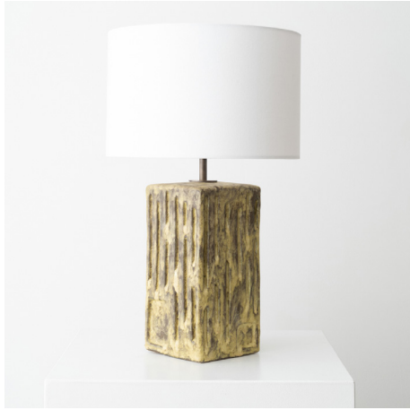
Channel Lamp Hand-built stoneware L 6" x W 6" x H 17"