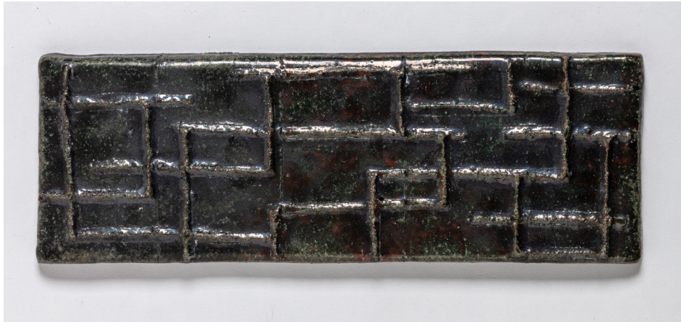
Glaze: Metallic Oribe Design: Grid WCS 050