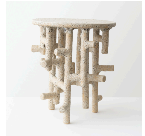
Extrude Side Table Hand-built stoneware Dia 16" x H 18"