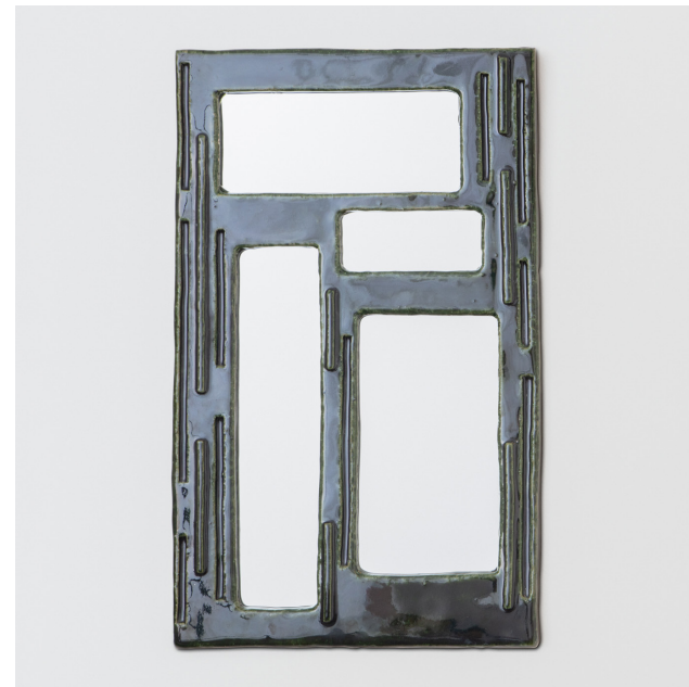
Channel Mirror Hand-built stoneware H 27" x W 16" x D 1"