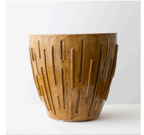
Channel Side Table Hand-built stoneware Dia 16 1/2" x H 17"