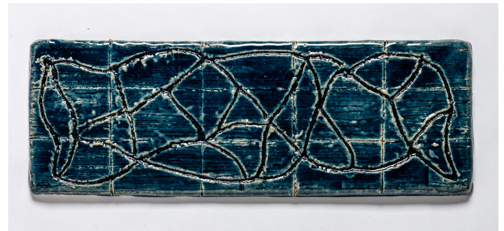
Glaze: Deb's Blue Design: Tangled WCS 035