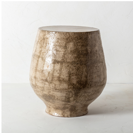
Ceramic Side Table Hand-built stoneware Dia 12 1/2" x H 18"