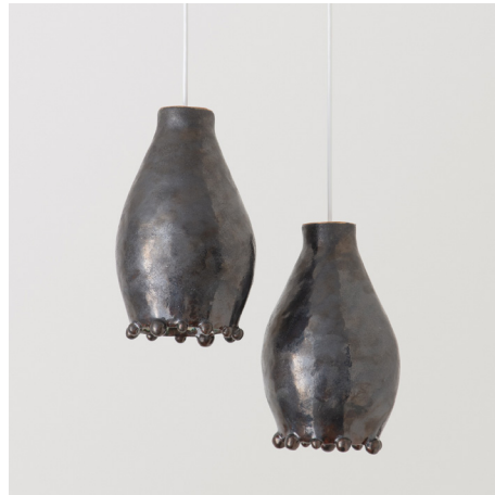
Bubble Pendant Hand-built stoneware Dia 8" x H 13"